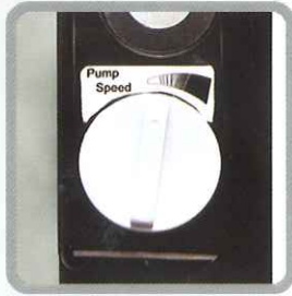
Pump Speed Control